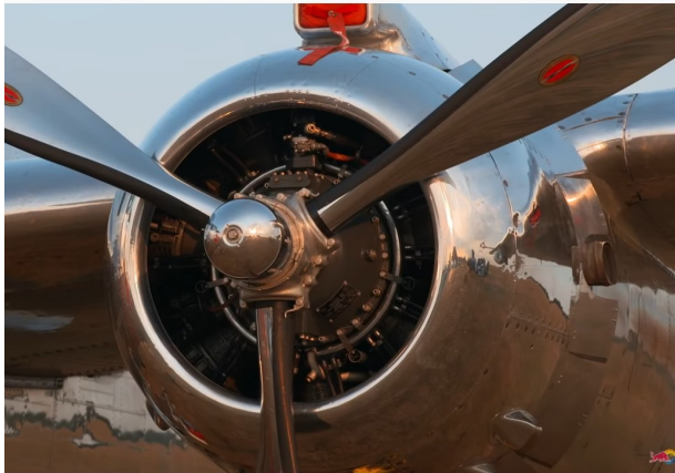
The Most Dazzling Aircraft Ever Built: The B-25J 'Mitchell' | The Flying Bulls