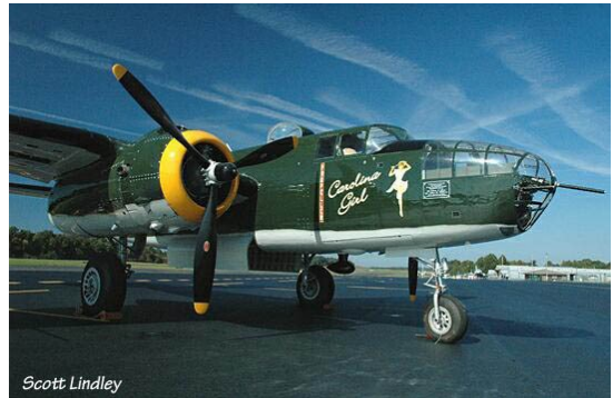
Number Still Airworthy