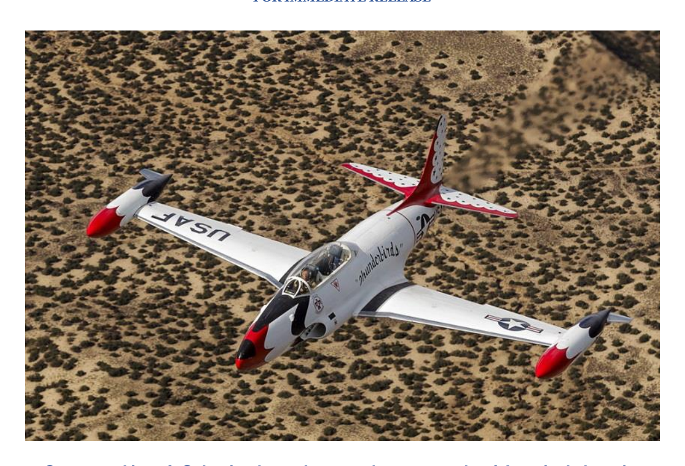
Courtesy Aircraft Sales is pleased to supply an example of America's best jet trainer!